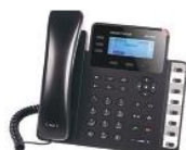
GXP1630 3 lines, 3 SIP accounts, PoE, 132x64 Backlit LCD, 3 XML, Gigabit Ports, 8 BLF Keys