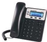
GXP1620/1625 2 lines, 2 SIP accounts, (Non-PoE/PoE), 132x48 Backlit, 3XML, 3-way conf.