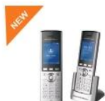
WP820 WiFi IP Phone, Bluetooth, HD Voice, Security