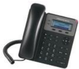
GXP1610/1615 2 lines, 1 SIP account, (Non-PoE/PoE), 132x48 LCD screen, 3XML, 3-way conf.