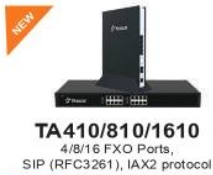
TA410/810/1610 4/8/16 FXO Ports, SIP (RFC3261), IAX2 protocol