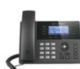
GXP1782 8 lines, 4 SIP account, 4XML, 5-way conf., PoE, Built-in USB port, Dual-switched Gigabit ports