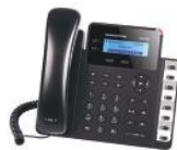
GXP1628 2 lines, 2 SIP accounts, PoE, 132x48 Backlit LCD, 3 XML, Gigabit Ports, 8 BLF Keys