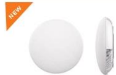
GSC3510/3505 2-Way audio / 1-Way audio, Bluetooth, WiFi, PoE/PoE+, Full-band and wide-band codec support