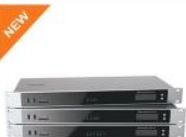
GXW4500 Series 1/24 - E1/T1/J1 support 30, 60, or 120 concurrent calls, Dual Gigabit Ports, Configurable NAT Router, 2 USB Ports, SD Card Slot(Extra Memory)