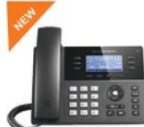
GXP1760W 6 lines, 3 SIP account, 4XML, 5-way conf., PoE, WiFi-enabled, HD wideband audio, Built-in USB port