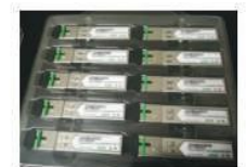
WI-SFP10-20KM 20KM 1.25Gbps Single Fiber module Transceivers Distance up to 20km over SMF, Simplex SC connector, Compliant with SFP MSA, Digital Diagnostic Monitoring, Hot-pluggable SFP footprint