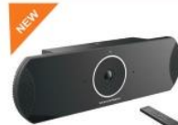
GVC3210 Video Conf. Supports SIP/Bluetooth/WiFi, 4K Resolution, 16 Megapixel CMOS, Lens - 90° field of view, ePTZ Integrated 1*HDMI in, 2* HDMI out, 2*USB