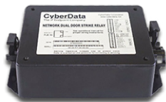
011375 Network Dual Door Strike Relay