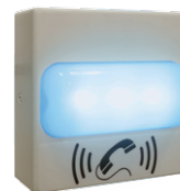
011288 Auxiliary RGB (Multi-Color) Strobe Kit