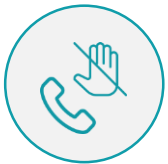
Do Not Disturb