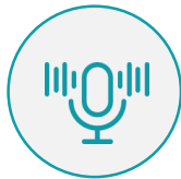
Music On Transfer