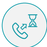
Call Forward on Busy