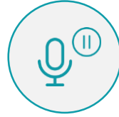
Music On Hold