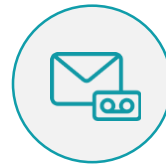
Voicemail to Email