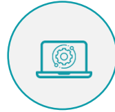
Remote Office Support