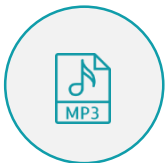
Flexible MP3-based System