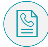
Call Details Records