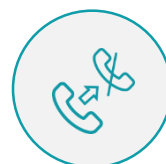
Call Forward on No Answer