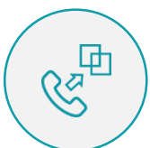
Call Forward Variable