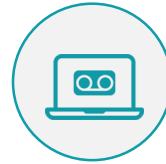
Web Voicemail Interface