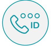
Caller ID on Call Waiting