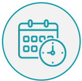
Time and Date