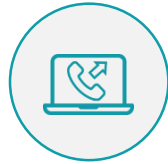
Direct Inward System Access