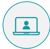
Local and Remote Call Agents