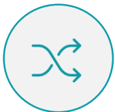
Random or Linear Play