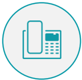
Flexible Extension Logic