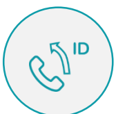
Route by Caller ID