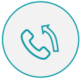
Call Routing (DID & ANI)