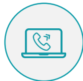
Remote Call Pickup