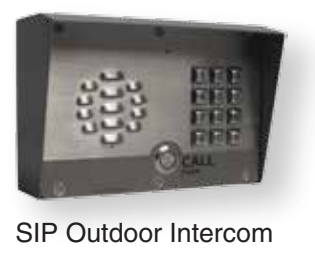
with Keypad #011214