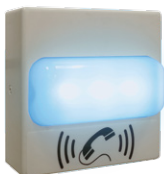
011288 Auxiliary RGB (Multi-Color) Strobe Kit