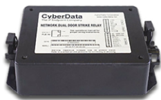
011375 Network Dual Door Strike Relay