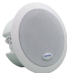
011511 VoIP SIP/Multicast Ceiling Mount Speaker