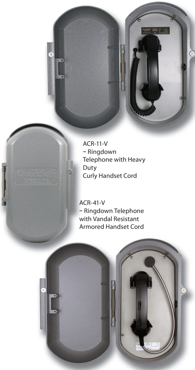
ACR-11-V – Ringdown Telephone with Heavy Duty Curly Handset Cord