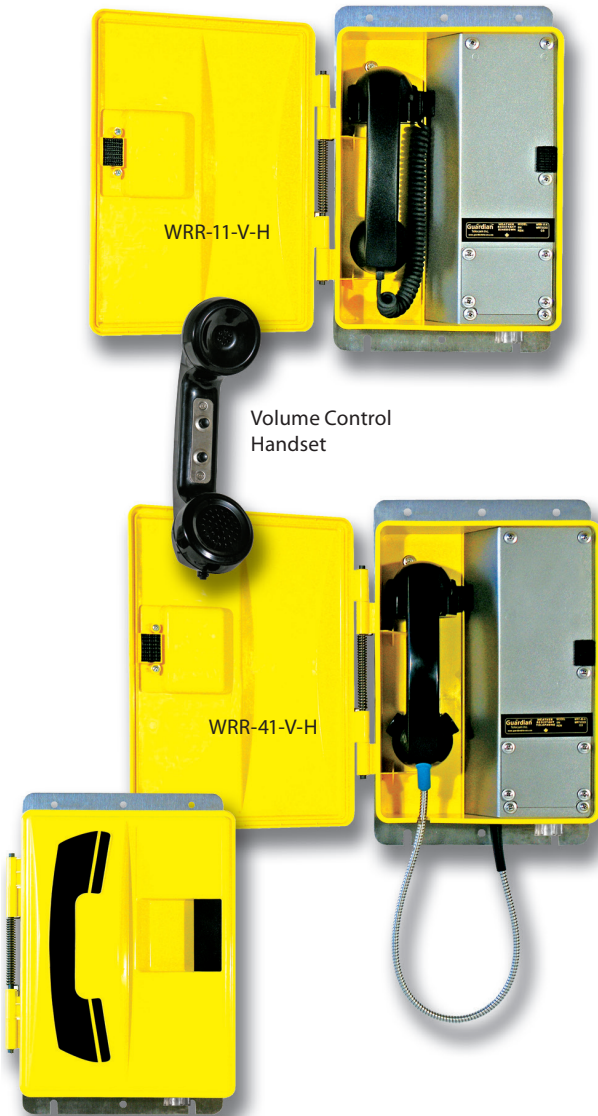
Volume Control Handset